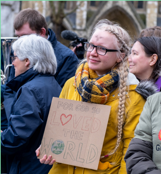
FOR GOD SO LOVED